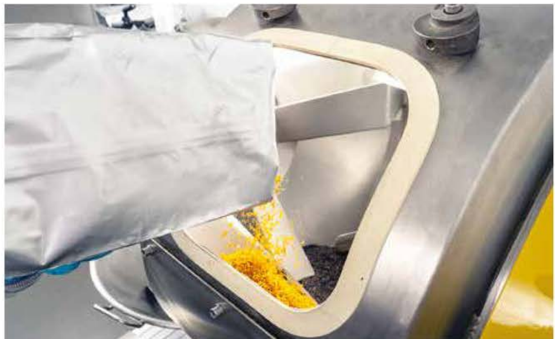
The mixer's tumble-turn-cut-fold action achieves uniformity in three minutes with no product degradation.

is to screen dust, twigs and foreign matter from the ingredients. "With chrysanthemum flowers, we want the blossoms but must remove the pebble-hard buds," said Biron. "Ginger root also requires a thorough cleaning."